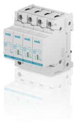
Parafoudres soulé ®